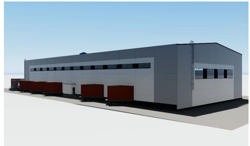
Warehouses (warehouse and household unit)